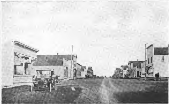
VIEW OF MAIN STREET, LOOKING NORTH, BAKE